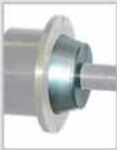
GAR112 (Ø 95-124mm) Off-road vehicles