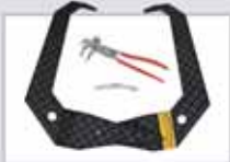
Plastic Caliper & Pliers