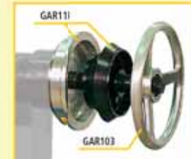
GAR113 (Ø 4.6"-6.8")