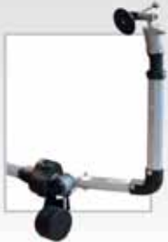
GAR 303 Digital sensor for wheel width and eccentricity measurement