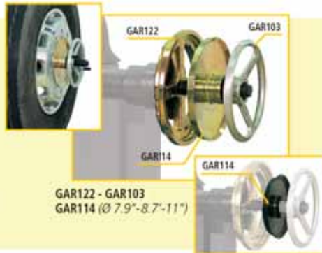
GAR122 - GAR103 GAR114 (Ø 7.9"-8.7"-11")