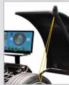
GAR334 LASERHEAD Internal and external laser blade shows precise 12 o'clock position in dynamic mode.