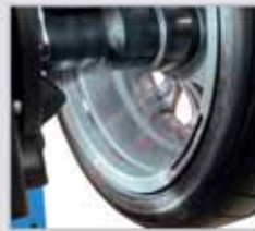
GAR322 (→ GP4, 140R, G4, 140R) Fixed laser