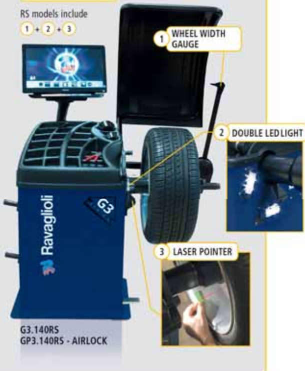
G3.140RS GP3.140RS - AIRLOCK