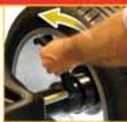
Rim run-out measurement with internal data gauge.