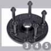
GAR133 (→ GAR132) Set of short stands