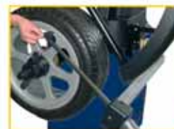
GAR266T - 3D SENSOR

Bluetooth wireless printer interface kit transfer data from the wheel balancer to your office pc. This allows reports and graphics to be printed by your office printer showing balance and eccentricity conditions of the tire and wheel.