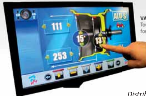
VARGM19T5 Touch screen version for G4 SERIES