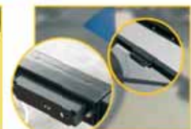
GAR214TK - SONAR RUN OUT (GAR266T required)