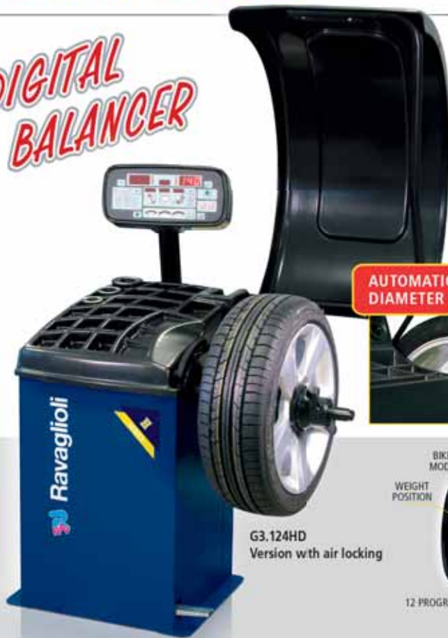
G3.124HD Version with air locking

AUTOMATIC DISTANCE + DIAMETER MEASUREMENT