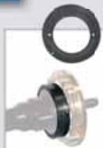
GAR 124 Space for GAR 112