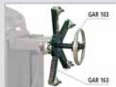
GAR 161 22,5"-18" FISCHER (Europa) GAR 162 20"-28" DAYTON (USA) GAR 163 24"-28" DAYTON (USA)