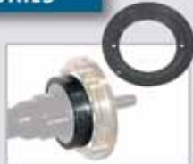
GAR124 Light Truck Cone & Spacer kit