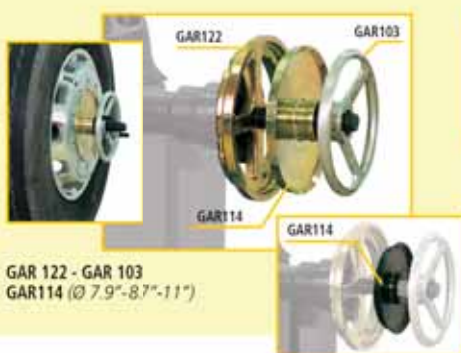
GAR 122 - GAR 103 GAR114 (Ø 7.9"-8.7"-11")