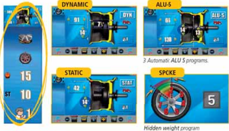
3 Automatic ALU S programs.