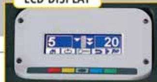
5" x 1 1/2" Backlit graphic LCD display.