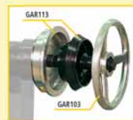
GAR113 (Ø 4.6"-6.8")