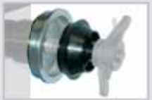
GAR 113 (Ø 4.64" - 6.85") Vans and light trucks