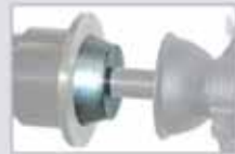
GAR 112 (Ø 3.74" - 4.88") Off-road vehicles