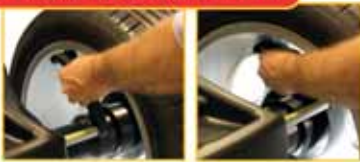
Automatic storage of distance and diameter.