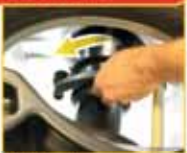
Quick selection with internal data gauge.