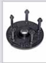
GAR 132 Precision flange