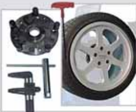
GAR131H Universal flange