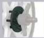
GAR132 Precision flange