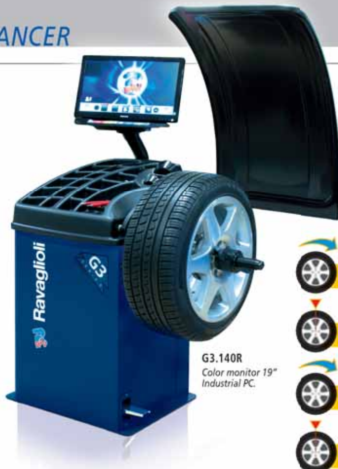
G3.140R Color monitor 19" Industrial PC.

Premium 3-D System with affordable 4-D upgrade option. Precise and fast with average 6 second cycle times, this durable DC driven workhorse maybe the most perfect balancer ever for the busy workshop. Standard with 4 cones and speed nut. Optional GAR213 automatic width data entry arm. Can be upgraded now or in the future by adding the RAV Sonar Runout Measurement and our Bluetooth printer interface kit.