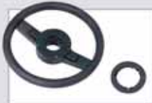
GAR102 Quick clamp for cars