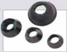
GAR111 (Ø 1.73" - 4.09") Car