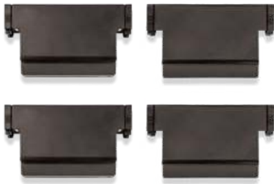
STDA128 (2 sets = 4 batteries) Two standard batteries and two spares