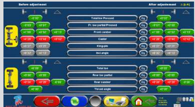
Data before and after adjustment