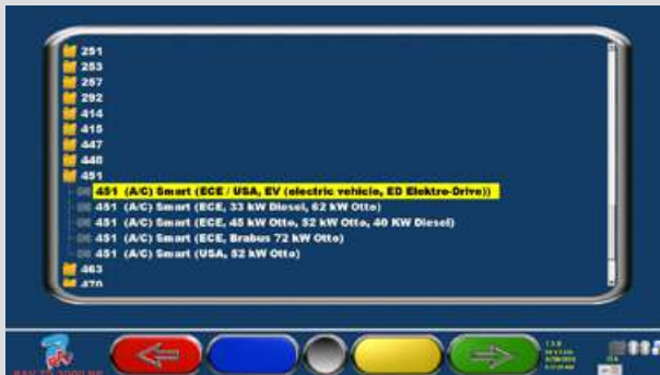
Original Mercedes database

Exclusive 3D targets: - extremely light - no electronic components inside