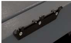
STDA117 Pair of brackets for lift mounting